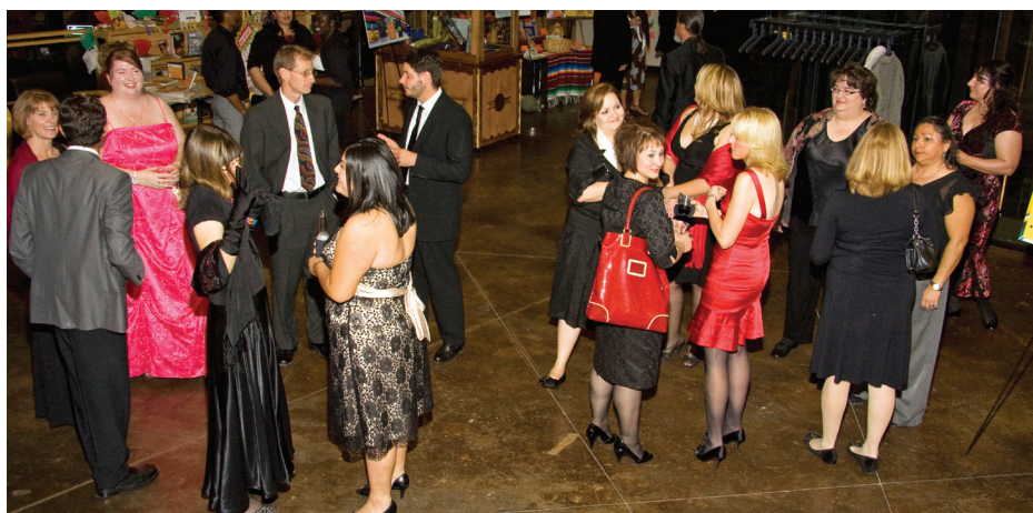
More than 100 library supporters attended the Booklovers Blacktie Ball.