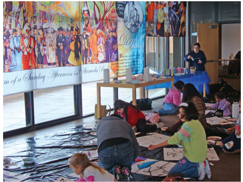
Enthusiastic artists participate in the community mural project.