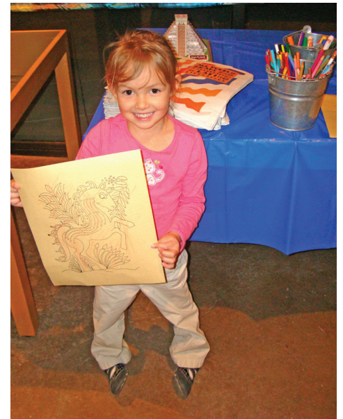
A young, happy patron shows off her coloring skills.