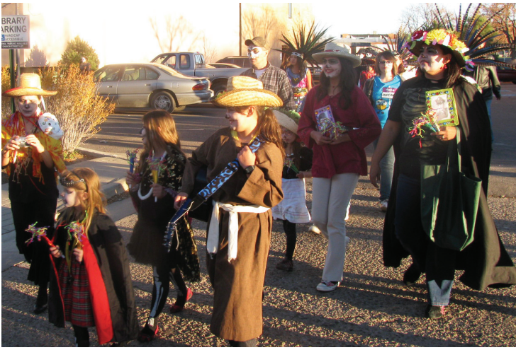
Día de los Muertos was celebrated with a parade from Rawlings Library to El Pueblo museum.