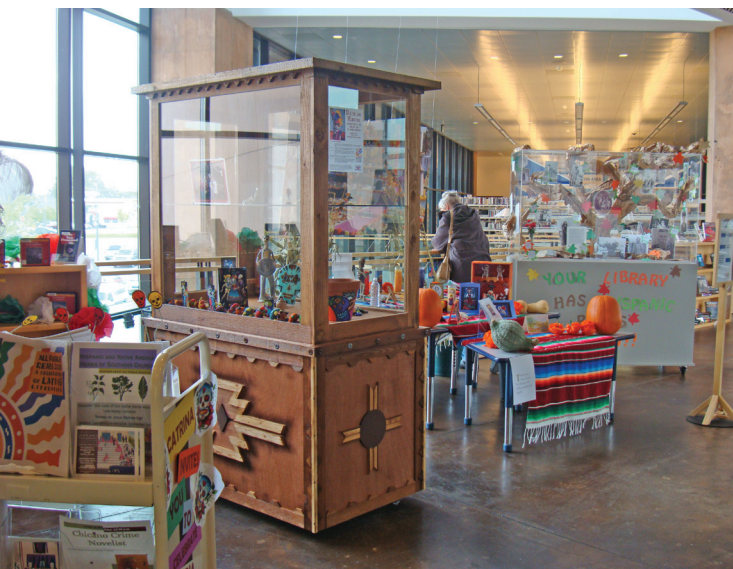
The second-floor display at the Rawlings Library.