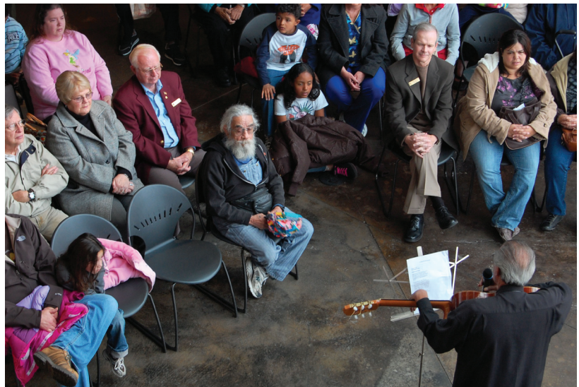
People listen to Mexican folk music at the Kickoff Celebration.

A $20,000 grant was awarded by the National Endowment for the Arts Big Read