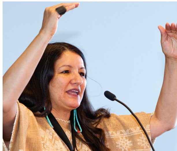
More than 400 fans saw author Sandra Cisneros.