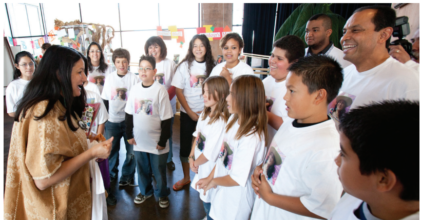
Risley Middle School students greet Sandra Cisneros with special T-shirts.