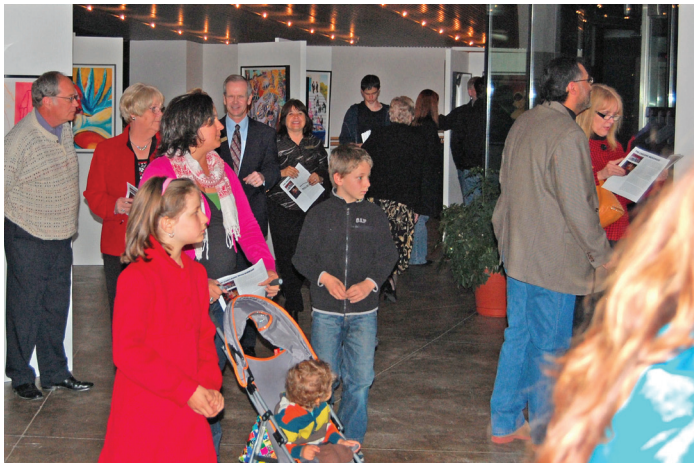
More than 100 attended the opening reception for the Cheech Marin Chicano Collection.