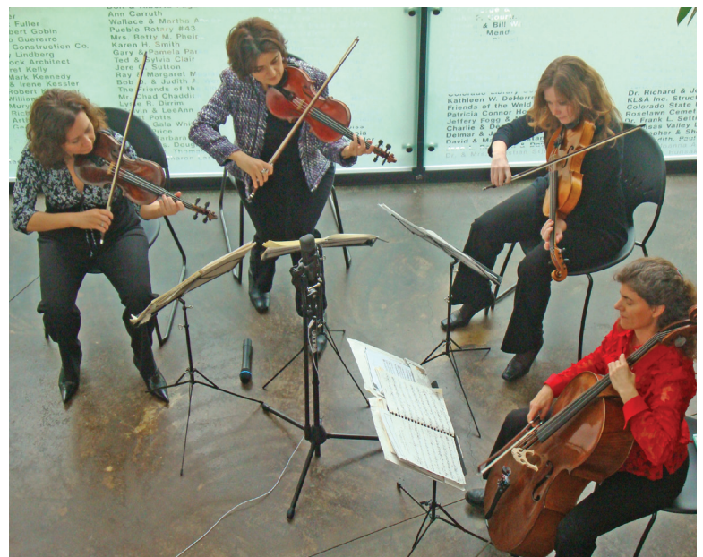
Veronika String Quartet performs at the Kickoff Celebration.